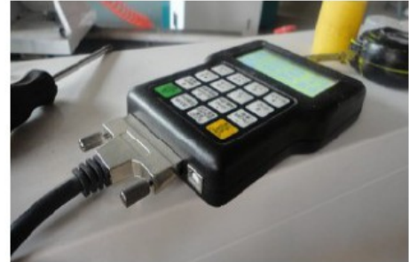
CL-5912CNC-RT 59" x 11.8" CNC Auto Woodworking Lathe (with extra Router Head for Carving, Spiral, Line) $19,900.00