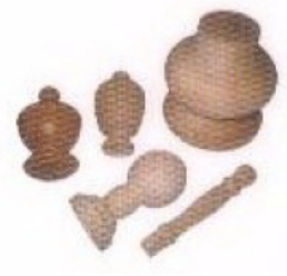
CL-5912CNC-2K 59" x 11.8" CNC Auto Woodworking Lathe (Double Knife) $18,900.00