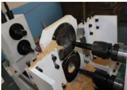
CL-5906CNC-DS 59" x 6" CNC Auto Woodworking Lathe (Double Spindle & Double Knife) $20,900.00