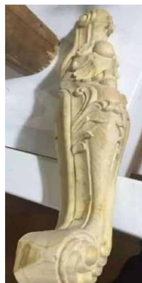
8 Spindle Model