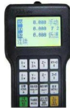
Control DSP system