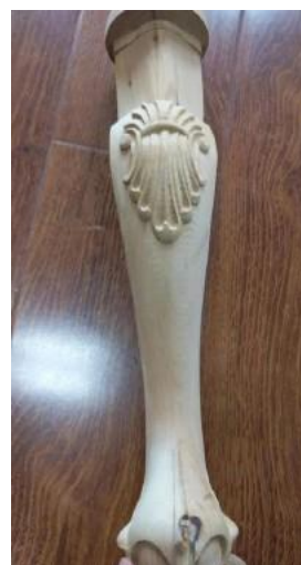
12 Spindles Model