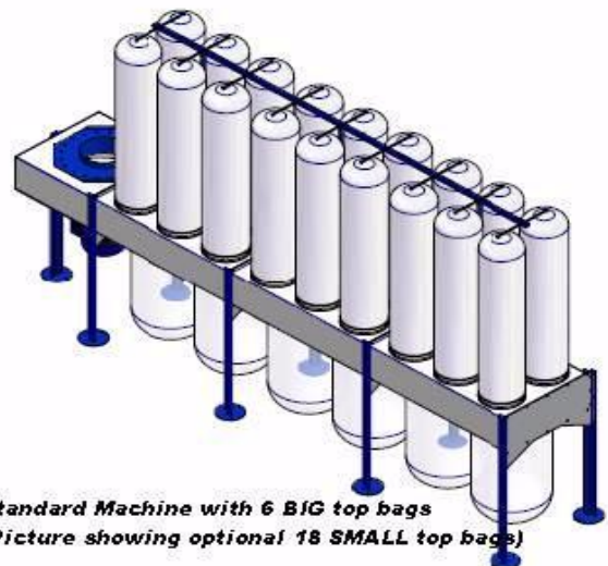
Standard Machine with 6 BIG top bags (Picture showing optional 18 SMALL top bags)