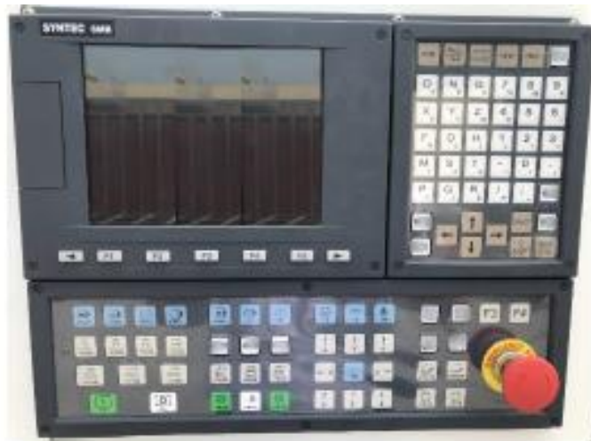
Syntec 6MB control