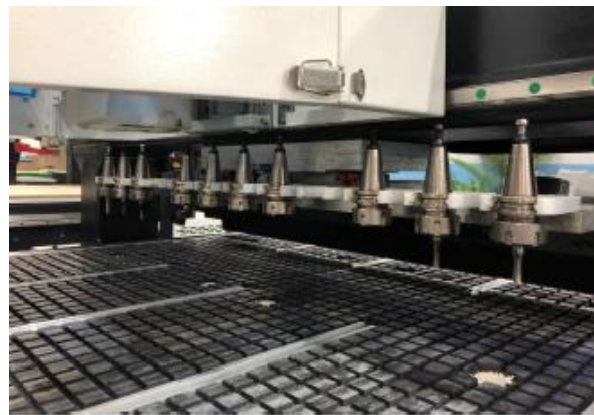
12 tools linear ATC