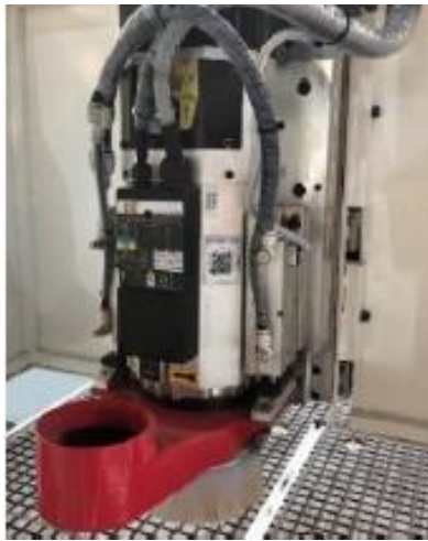
9.0 kW spindle