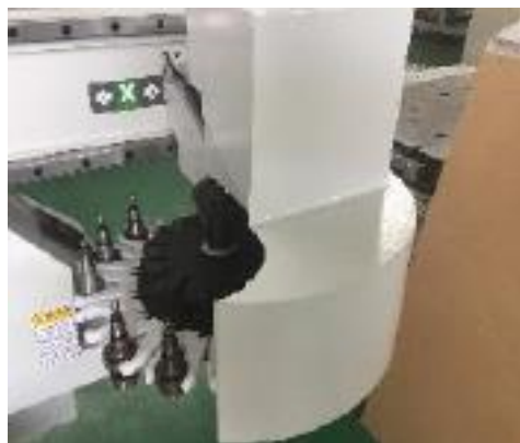
12 tools linear ATC