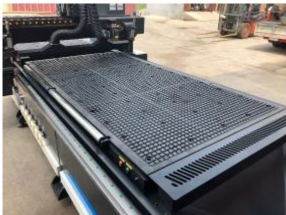
6 zones Vacuum table